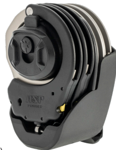
Exo Duo (Ultra and Sentry)