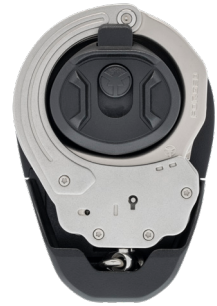
Exo-S (Sentry Chain or Hinge)