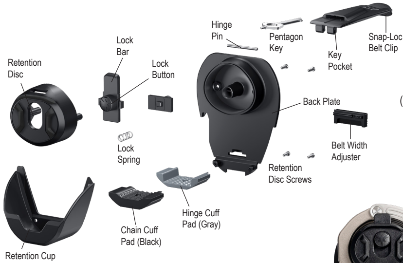
Exo (Ultra Plus Chain or Hinge)