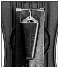
Handcuff Key Pocket