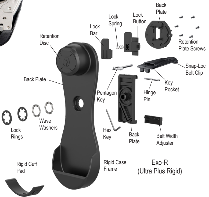
Exo-R (Ultra Plus Rigid)