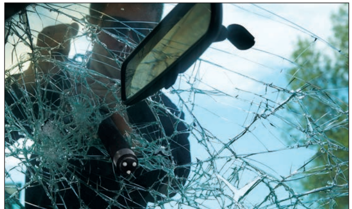
BreakAway attachments can break out windshields for emergency entry. Punch a large circular pattern with the BreakAway. The ceramic pins will penetrate the glass making it possible to break out the perforated area.