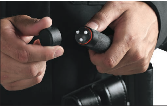
Subcap window breakers can be attached between the cap and handle of any ASP Baton. They add less than .75" to the baton length.

The ASP BreakAway® subcap is designed to be interposed between the cap and handle of an expandable baton. It is always available. It is readily at hand. Removing the baton cap exposes the three ceramic pins of the BreakAway. Set in a machined aluminum geodome, at least one pin will make contact with the tempered glass of a car window whatever the angle of application. The officer can stand to the side of a threat, grasp the tip of the baton and easily shatter any vehicle window. Entry is rapid and tactically sound.