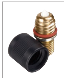
The tip of each BreakAway is ground from hardened ceramic.