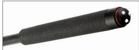
The three ceramic pins of the BreakAway provide instant entry through tempered glass.