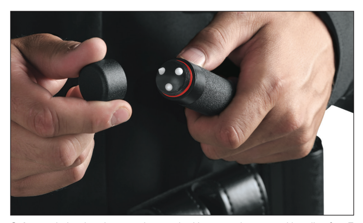
Subcap window breakers can be attached between the cap and handle of an F Series Baton. They add less than .75" to the baton length.

The ASP BreakAway® subcap is designed to be interposed between the cap and handle of an expandable baton. It is always available. It is readily at hand. Removing the baton cap exposes the three ceramic pins of the BreakAway. Set in a machined aluminum geodome, at least one pin will make contact with the tempered glass of a car window whatever the angle of application. The officer can stand to the side of a threat, grasp the tip of the baton and easily shatter any vehicle window. Entry is rapid and tactically sound.