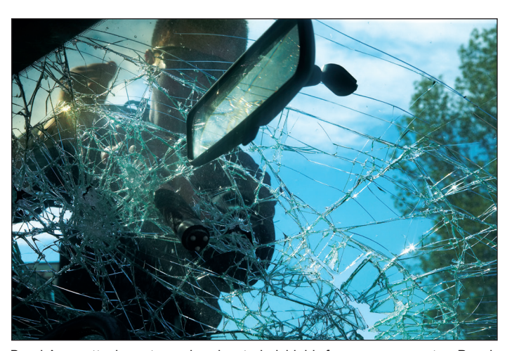
BreakAway attachments can break out windshields for emergency entry. Punch a large circular pattern with the BreakAway. The ceramic pins will penetrate the glass making it possible to break out the perforated area.