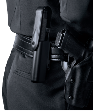
Revolution Scabbards are protective, secure and easily attached.