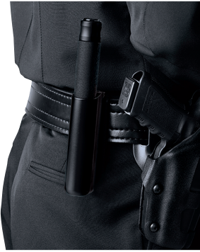
Envoy Scabbards are easily attached and rigidly secure.