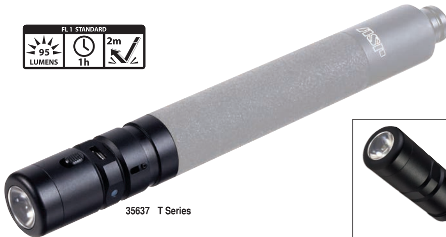
35637 T Series