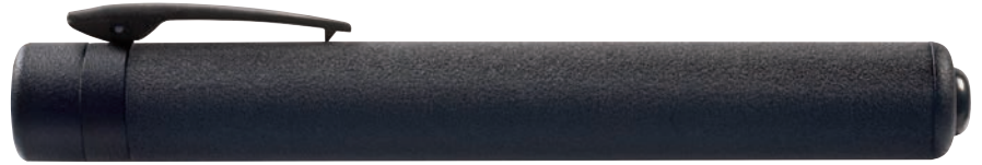
52931 F Series