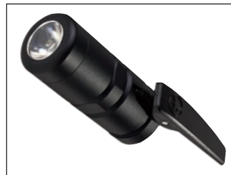
35638 Fusion T