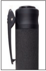
52932 T Series

Nexus Baton Clips are compatible with all F Series (Friction Loc) and T Series (Talon) Batons. They may be attached to 16, 21 or 26 handles and allow the use of Logo, Grip, Leverage and Tactical USB accessory caps. They are also available for 40, 50 and 60 Talon Batons.