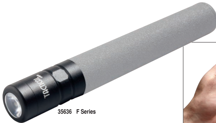
35636 F Series