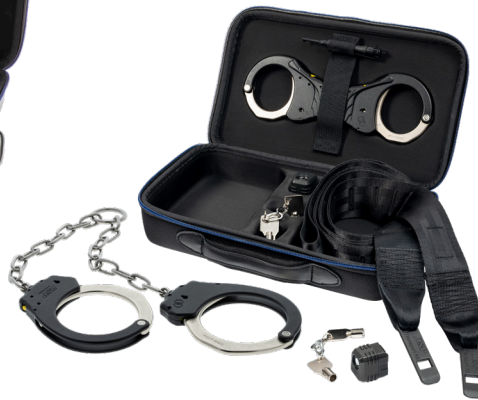
Transport Plus (Belt)