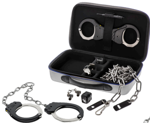
Transport Plus (Chain)