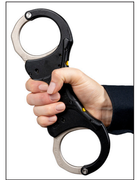
Rigid Ultra Plus Cuffs provide linear and lateral security.