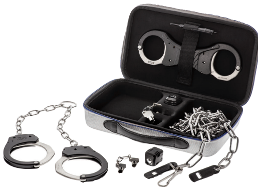
TRANSPORT PLUS (CHAIN)