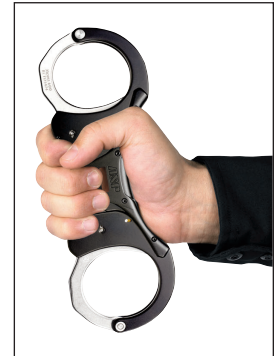
Rigid Ultra Cuffs provide linear and lateral security.