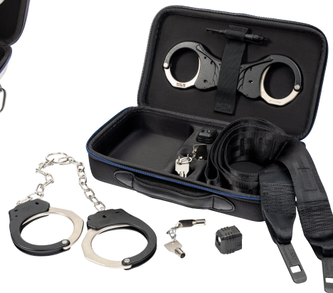
TRANSPORT PLUS (BELT)