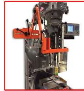
MG-1 Floor Mount