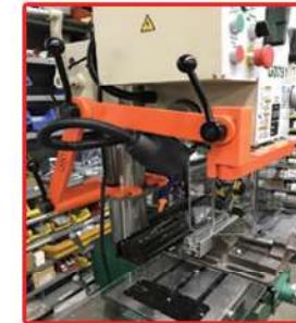
DPG-2 4" to 6.5" post 18" to chuck