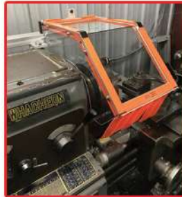
LG-TR3-12 Hinged - 12" lg Up to 10" chuck