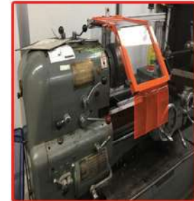
LG-TR2 Hardinge HLV / Toolroom