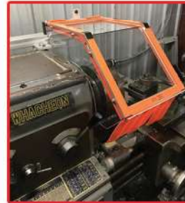
LG-TR3-18 Hinged - 18" lg Up to 10" chuck