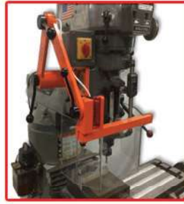
MG-2 Head Mount