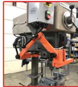
DPG-1 2.5" to 4" post 12" to chuck