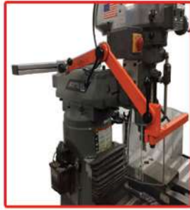
MG-3 Ram Mount