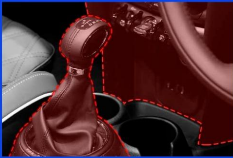
1. Close to dashboard