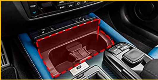
3. Covers or lids