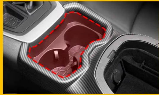
2. Raised edges