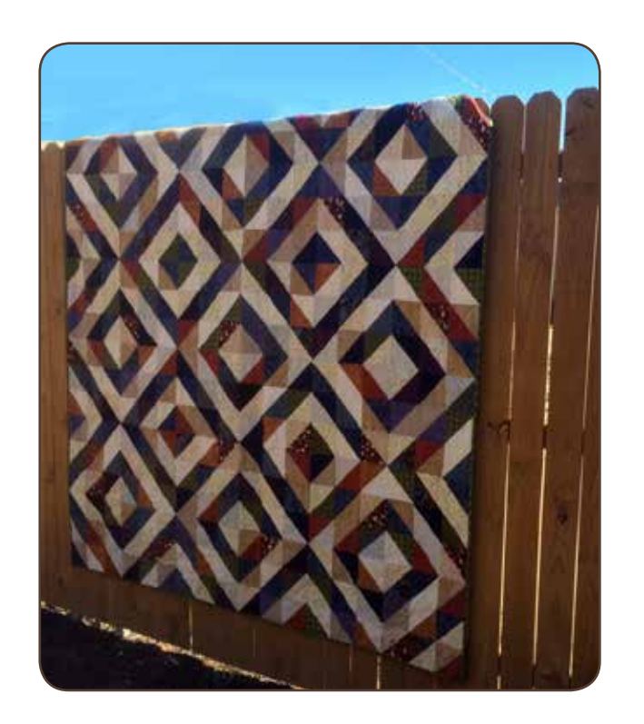
Friendship Half Square Triangle 74" x 74"