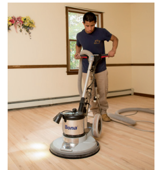
With Dust Containment