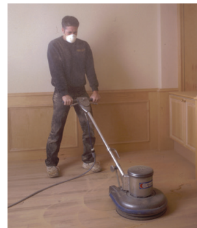
Without Dust Containment

The Bona Atomic® Dust Containment Systems will increase your satisfaction by providing higher quality results and healthier conditions in your home. Bona Atomic Dust Containment Systems are GREENGUARD Indoor Air Quality Certified®, and the Bona system is the only GREENGUARD Certified hardwood floor system in the industry.