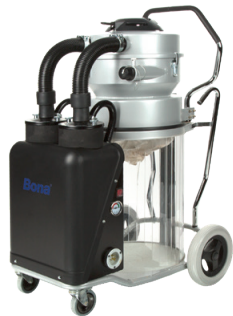
Bona Portable DCS® 2.0