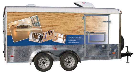
Bona Atomic Trailer - Mounted