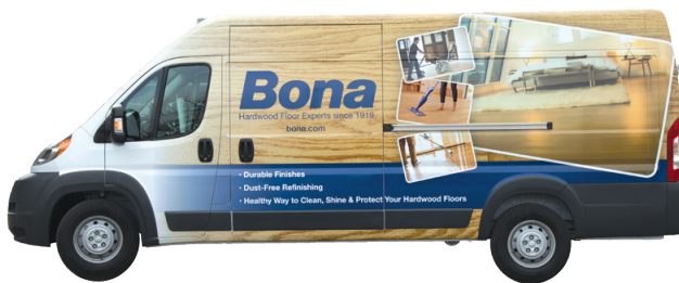
Bona Atomic Van

The innovative concept of the van-mounted or trailer-mounted Bona Atomic Dust Evacuation System means having a more powerful system while providing evacuation of the airborne dust that is generated from the entire sanding process.