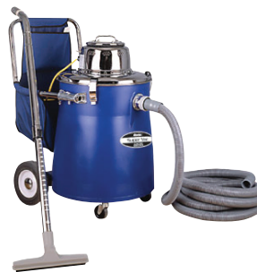
Bona DCS® Super Vac