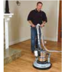
With Dust Containment