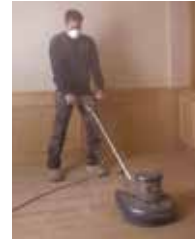
Without Dust Containment