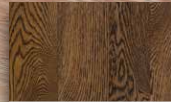
GARNET / CHARCOAL