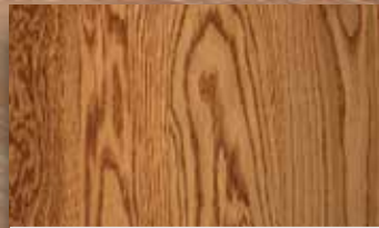
NEUTRAL / GARNET