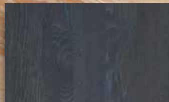
CHARCOAL / SAND