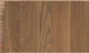
SAND / PEBBLE