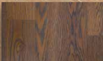
CLAY / ASH