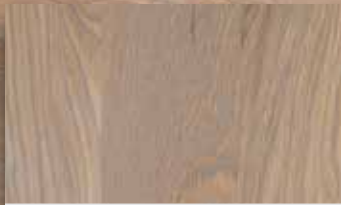
ASH / FROST