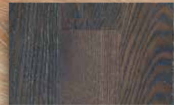
CHARCOAL / FROST