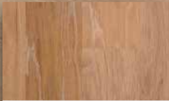
NEUTRAL / FROST