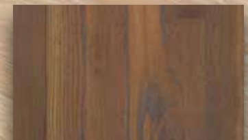
CLAY / PEBBLE