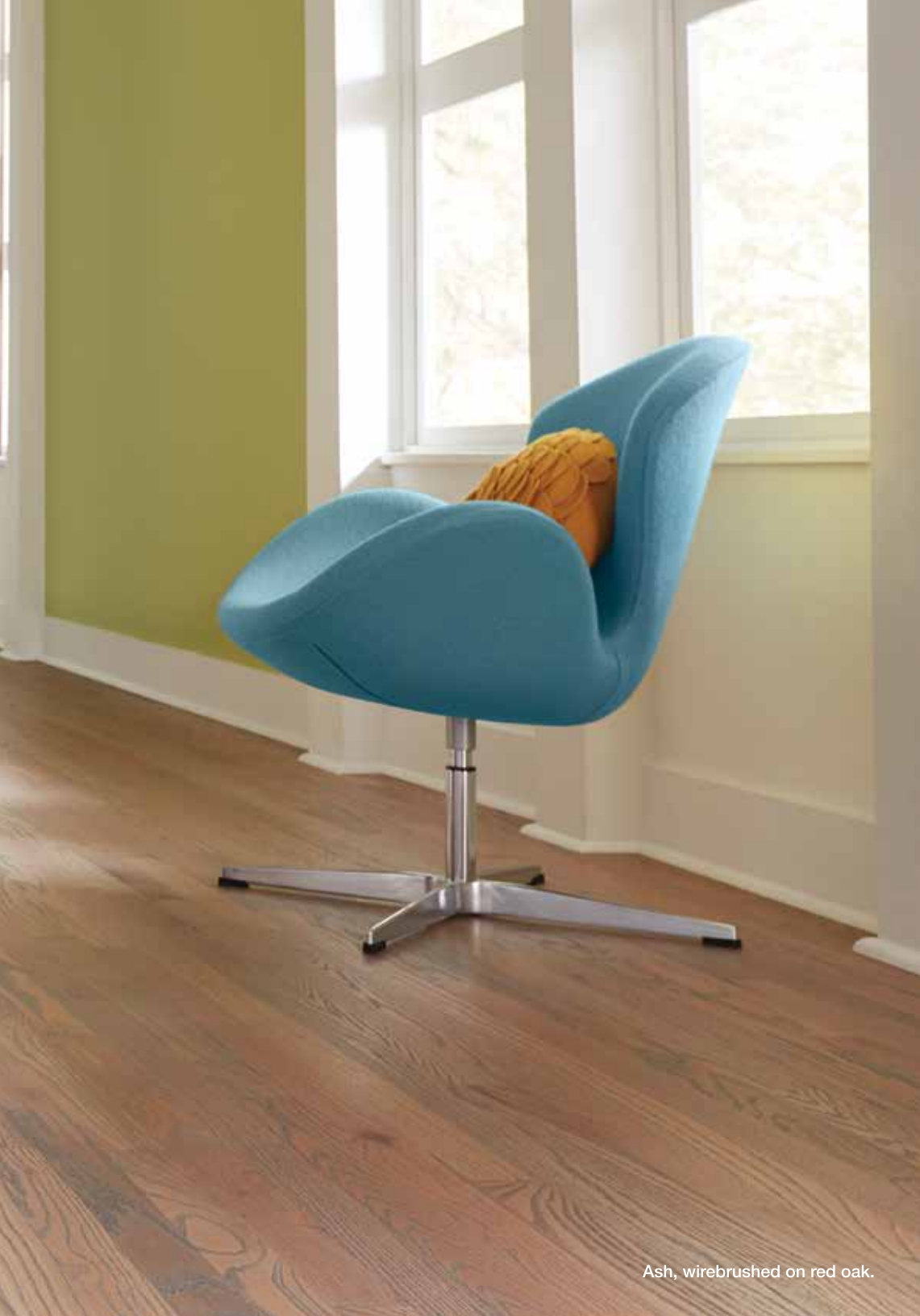
Ash, wirebrushed on red oak.