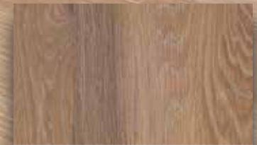
AIR / FROST