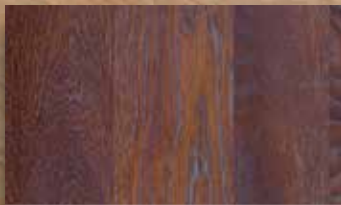
GARNET / FROST