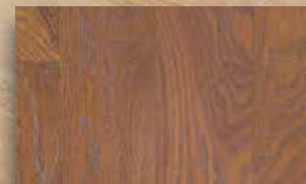
GARNET / SAND