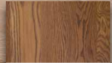
ASH / CLAY