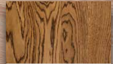
GARNET / CLAY