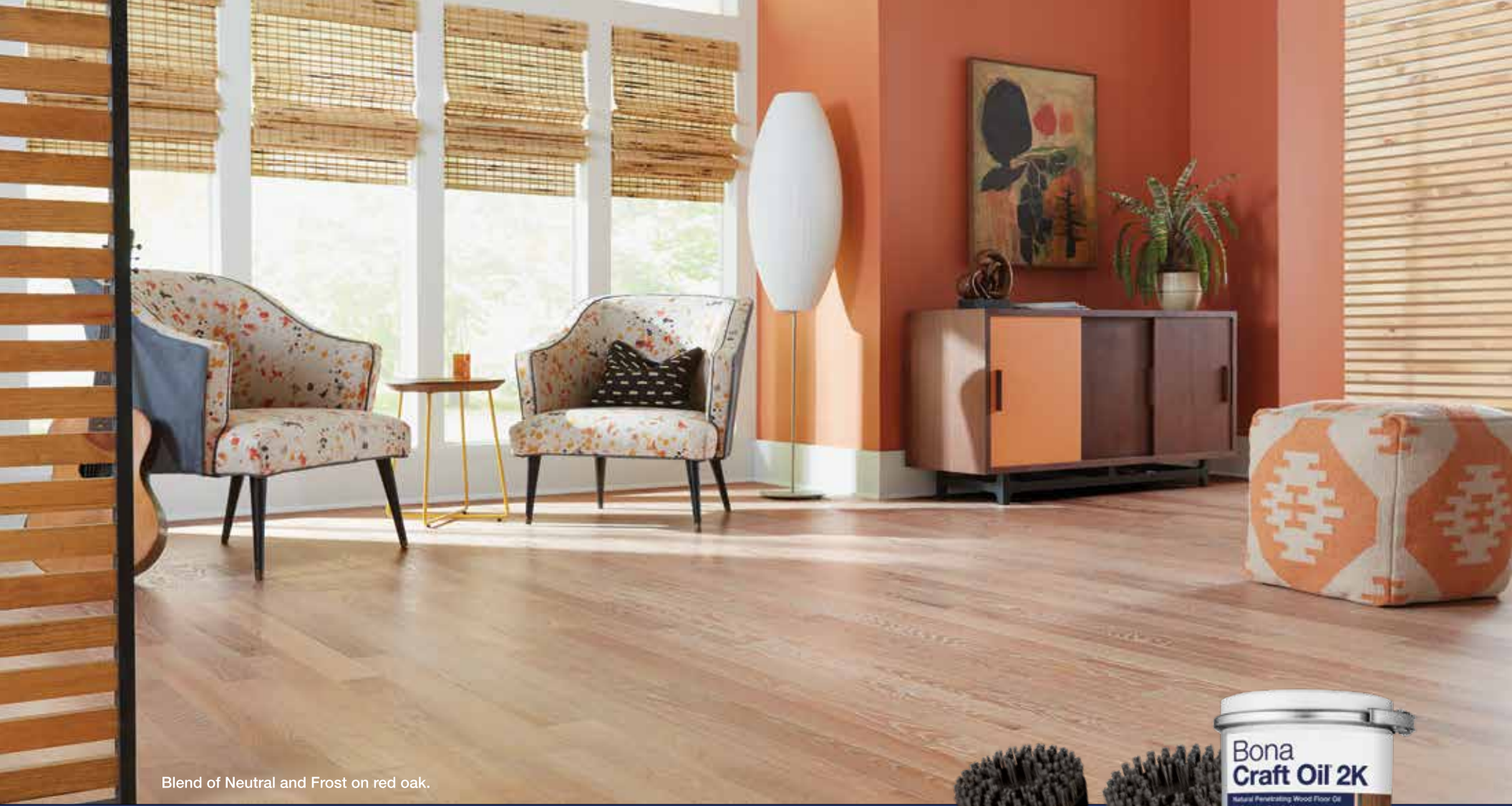
Blend of Neutral and Frost on red oak.