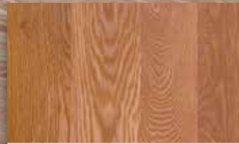
GARNET / FROST