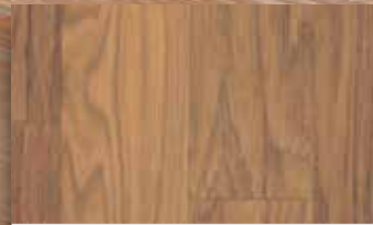
NEUTRAL / ASH