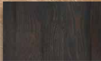
CHARCOAL / ASH