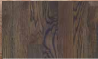
CHARCOAL / AIR