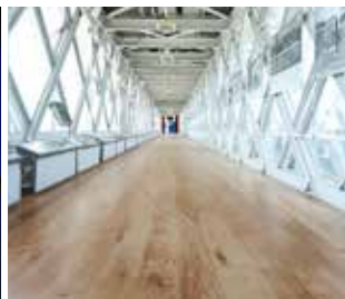
Tower Bridge in London Bona ClassicSeal + Bona Traffic