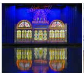
Moulin Rouge in Paris Bona IntenseSeal + Bona Mega

That's why Bona protects millions of square feet of floors in the toughest and most prestigious places throughout the world. Choose the Bona System® and enjoy an exceptional result every time. It's as simple as that.