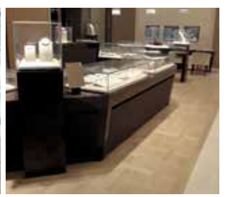
Bulgari shop in Singapore Bona IntenseSeal + Bona Traffic Naturale