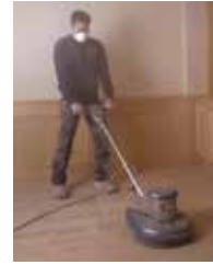
Without Dust Containment