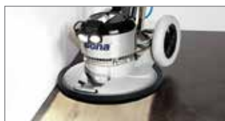
Works closer to walls and minimizes edge sanding.