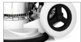
Large wheels for easy transport.