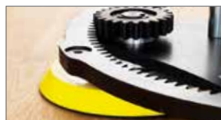
Dynamic cog system for sanding power.