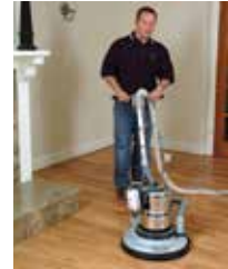
With Dust Containment