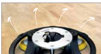
Direction-Free Sanding for Optimum Smoothness