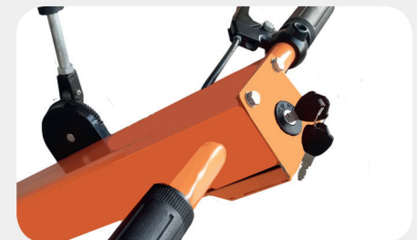
Lock out safety keys - Locking Throttle