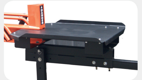
Oversize steel work table