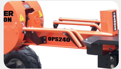
8" Expansive solid steel wedge