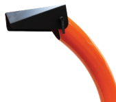
PICKUP TRUCK BED HEIGHT