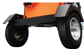
4.8-8 PNEUMATIC TIRES