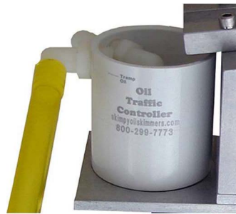
OIL TRAFFIC CONTROLLER