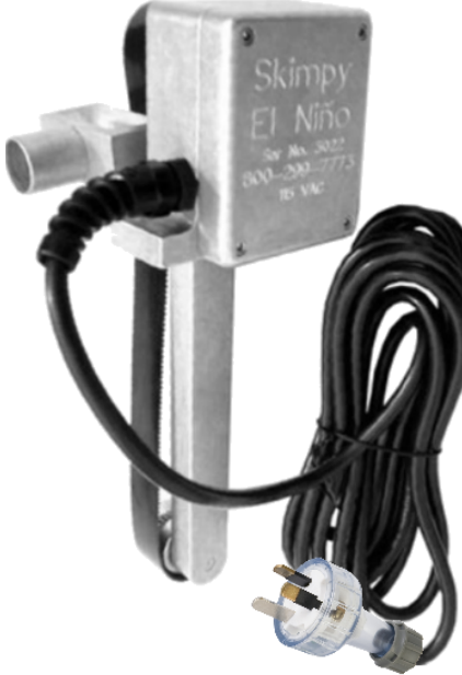
EL NINO BELT SKIMMER