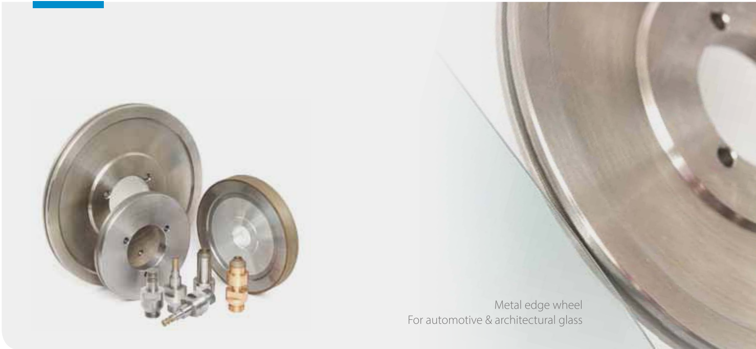
Metal edge wheel For automotive & architectural glass