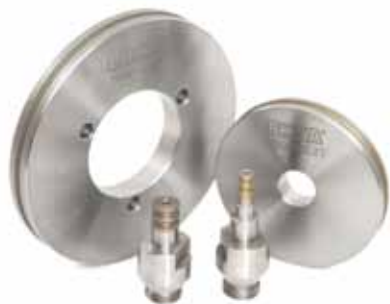
Home appliance glass