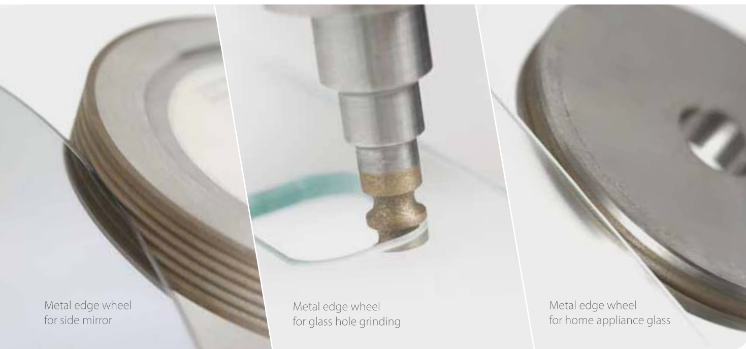
Metal edge wheel for side mirror