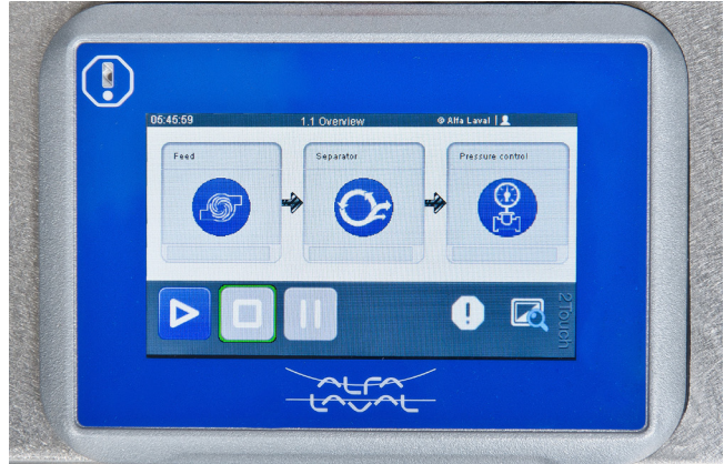
The Alfie 500 user-friendly control panel.

Our global organization guarantees easy start-up and, if you need a helping hand, an Alfa Laval service engineer is always close by. To support your operations further, Alfa Laval has a network of distributors and service partners who are always available to assist you. We call this nonstop performance.