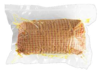
Product code ROSSGF500