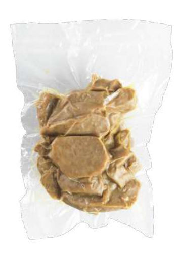
Product code CHKNPCSF5