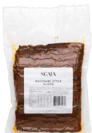
Product code PAST700