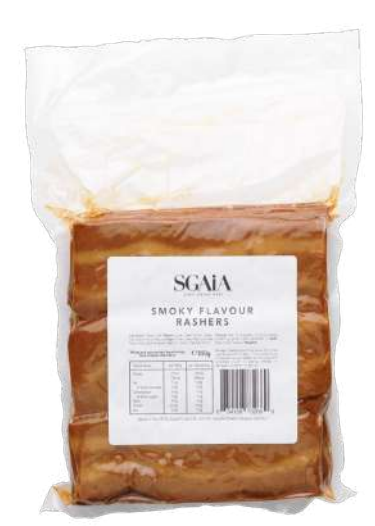
Product code RASHERS850