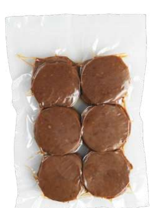
Product code PEPPE5

Please store chilled below 5C, once opened eat within 3 days. This product is fully cooked and vacuum sealed, do not consume if unopened pouch is leaking, inflated or damaged.