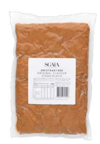
Product code ORISTEAK1000