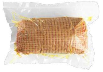
Product code ROSSGF500