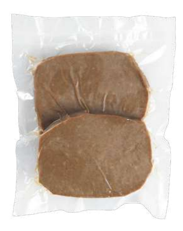
Product code ORISTEAKF5

Please store chilled below 5C, once opened eat within 3 days. This product is fully cooked and vacuum sealed, do not consume if unopened pouch is leaking, inflated or damaged.