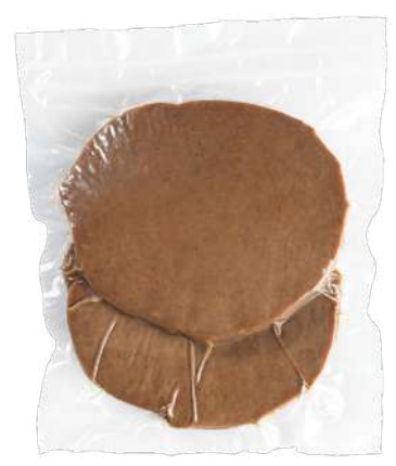
Product code SMOSTEAKF5

Please store chilled below 5C, once opened eat within 3 days. This product is fully cooked and vacuum sealed, do not consume if unopened pouch is leaking, inflated or damaged.