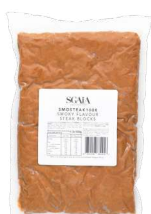
Product code SMOSTEAK1000