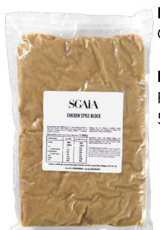
Product code CHKN1000