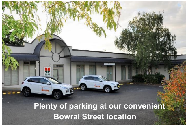
Plenty of parking at our convenient Bowral Street location

Servicing the Southern Highlands, Wollondilly & Goulburn