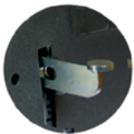
MECHANICAL FOOT PEDAL RELEASE