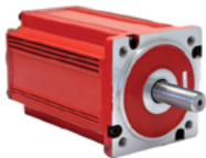
BRUSHLESS DC MOTOR CONTINUOUS DUTY 36V