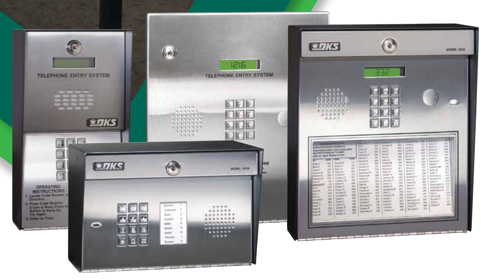
Residential • Small Multi Unit • Small Commercial/Industrial