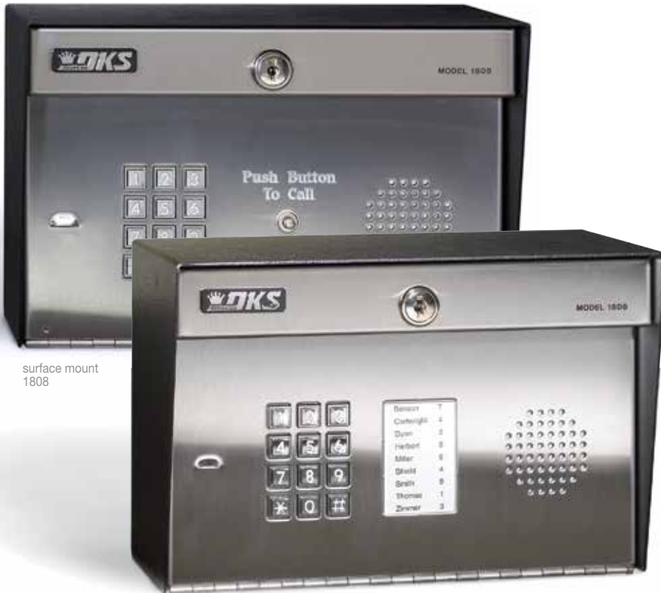
surface mount 1808

IDEAL FOR RESIDENTIAL AND SMALL COMMERCIAL OR APARTMENT APPLICATIONS