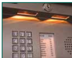
led lighting illuminates keypad and directory