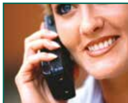
talk to your guest at a front door or gate from any telephone in the house