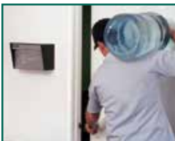
flash entry codes allow entry on a single day only, then automatically deactivate themselves