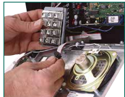
modular design makes installation and service easy