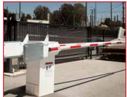
wishbone style aluminum arms up to 27 feet in length