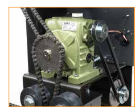
full size gearbox heavy-duty 30:1 ratio gearbox