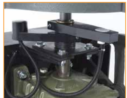
easily adjustable electronic magnetic limits