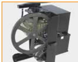
steel frame for strength and durability