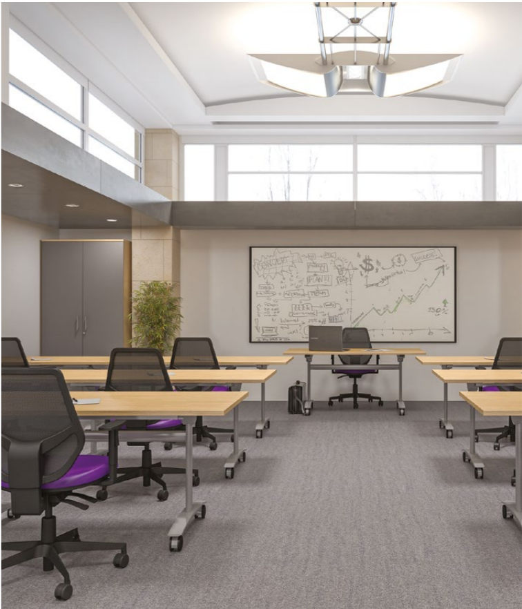
Tilt Top Tables are available in 800mm & 600mm depths in various shapes offering flexibility when creating configurations