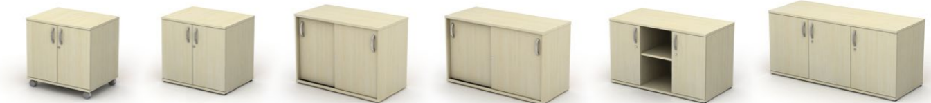
600mm deep mobile cupboard