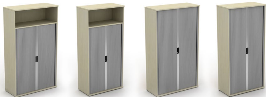
1200mm & 1000mm wide open tambour units

(available as 2062mm, 1657mm, 1252mm, 847mm & 725mm high)