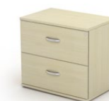
525mm & 600mm deep side filers