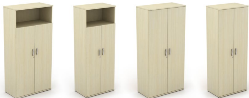
1000mm & 800mm wide open cupboards

(available as 2062mm, 1657mm, 1252mm, 847mm & 725mm high with a choice of handle)