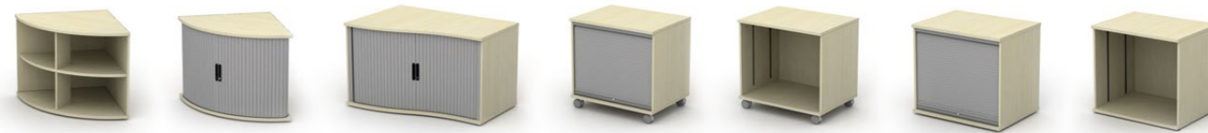
radial end open storage