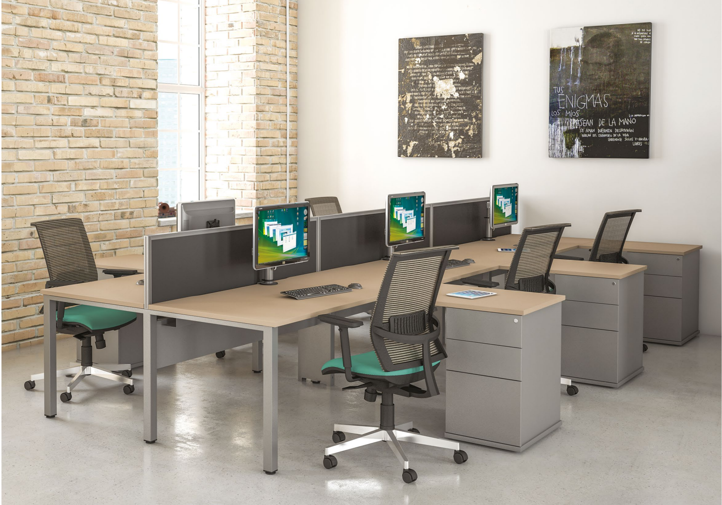
As an alternative to the standard wood grain desk finish, Mocha is ideally suited to complement all three Pure Bench trim colours

Pure Bench has all the characteristics of a modern bench system . Leg sharing capability, extension frames, shared cable management and frame mounted screens, allowing Pure Bench to be a competitive alternative to iBench.