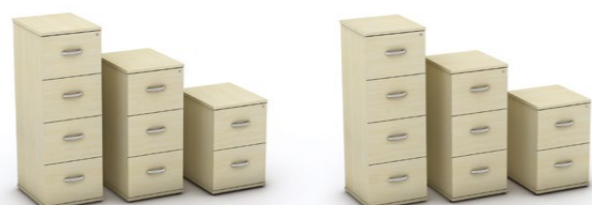
600mm deep filing cabinets (4, 3 or 2 drawers)