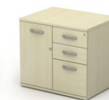
combination cupboard unit