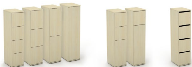
personal lockers available with various door options

(choice of 2, 3, 4 or a single door option)