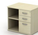
combination open unit