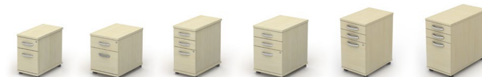
narrow mobile pedestals