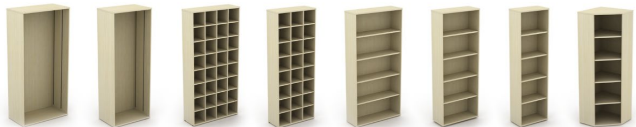
1000mm & 800mm wide open units