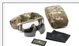
U.S. MILITARY KIT - TAN499 MULTICAM