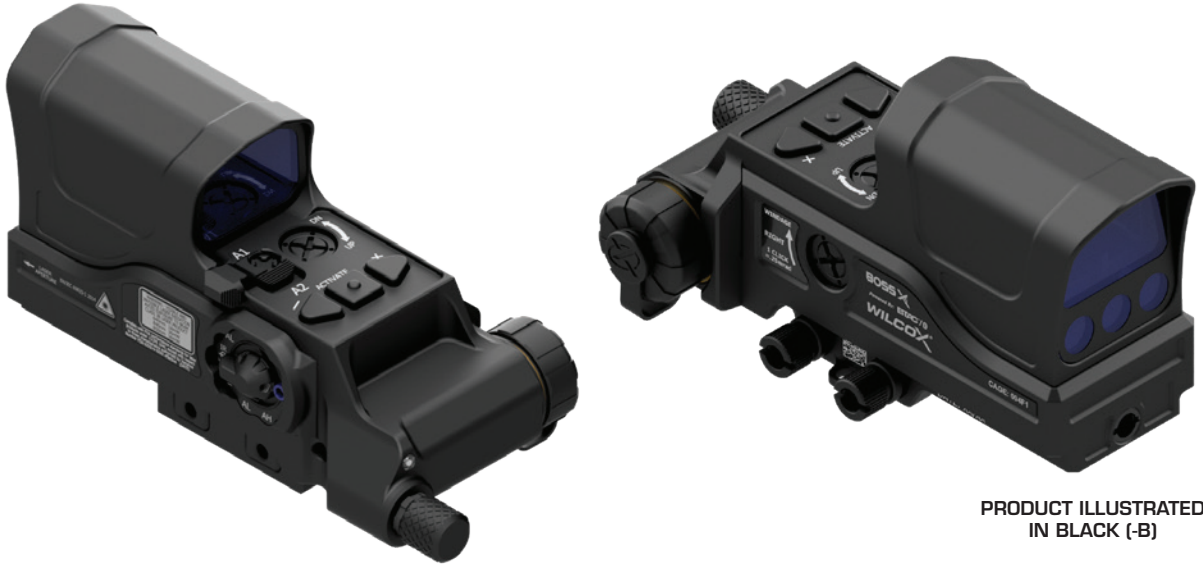
PRODUCT ILLUSTRATED IN BLACK (-B)

BALLISTICALLY OPTIMIZED SIGHTING SYSTEM - ENHANCED - LOW POWER