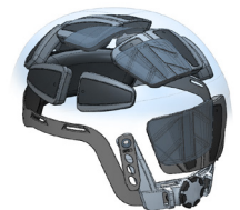
Comfort Layer Option