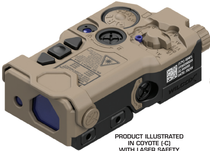
PRODUCT ILLUSTRATED IN COYOTE (-C) WITH LASER SAFETY HOOD OPEN

RUGGEDIZED AIMING/ILLUMINATION DEVICE - ENHANCED - LOW POWER