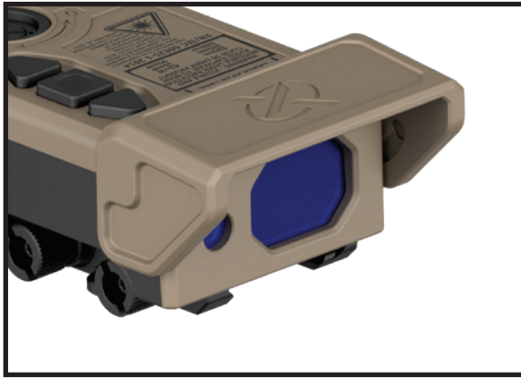
PRODUCT ILLUSTRATED** WITH LASER SAFETY VISOR OPEN