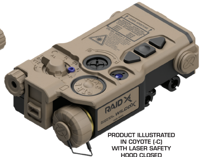
PRODUCT ILLUSTRATED IN COYOTE (-C) WITH LASER SAFETY HOOD CLOSED