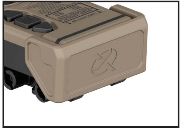
PRODUCT ILLUSTRATED** WITH LASER SAFETY VISOR CLOSED