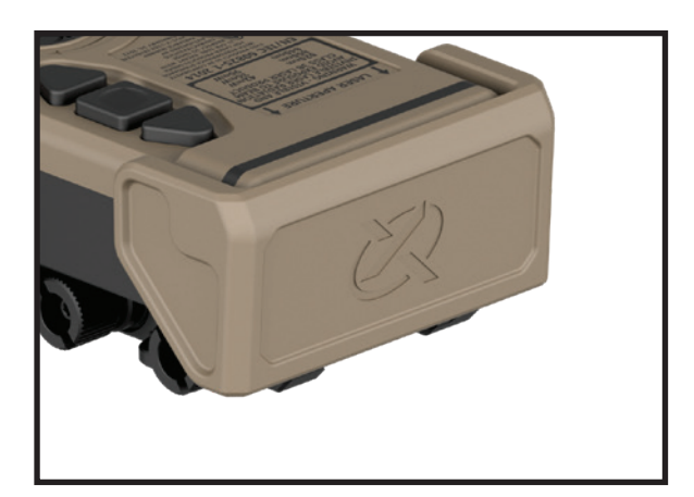
PRODUCT ILLUSTRATED** WITH LASER SAFETY VISOR CLOSED

PRODUCT ILLUSTRATED** WITH LASER SAFETY VISOR OPEN