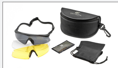
SAWFLY DELUXE KIT