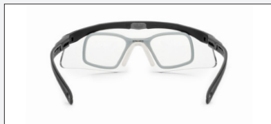
OPTIONAL RX CARRIER