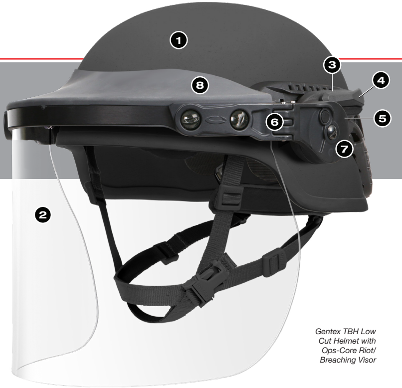
Gentex TBH Low Cut Helmet with Ops-Core Riot/Breaching Visor

The Ops-Core Riot/Breaching Visor offers modular, rapidly-employed face protection for operators with Ops-Core ARC Rail-equipped helmets. The 3mm thick visor smoothly pivots up and down to provide full face protection as needed. The visor effectively keeps end users safe in riot and breaching operations.