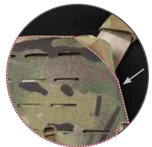
Lightweight, hydrophobic plate wrap system