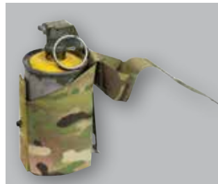
SMOKE GRENADE POUCH