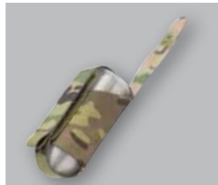
SINGLE 40MM POUCH

The OSS Redux is a series of minimalistic and practical set of pouches designed to be paired with our PF-R™, yet versatile enough to be used with any of our carriers or standard MOLLE/PALS webbing system. This series is constructed of light-weight, hydrophobic material that is durable, long-lasting and will shed water to reduce weight in wet environments.