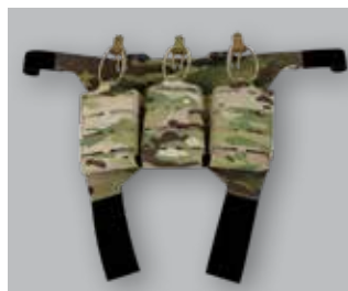
3 MAG POUCH RAP