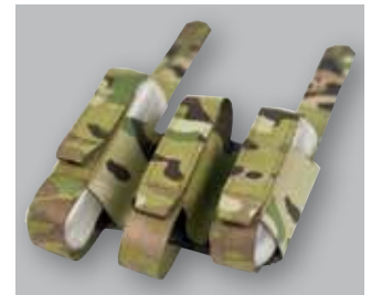
TRIPLE 40MM POUCH