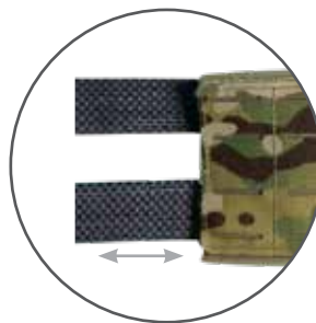
Auto-Fit Cummerbund™ and thoracic load-bearing technology