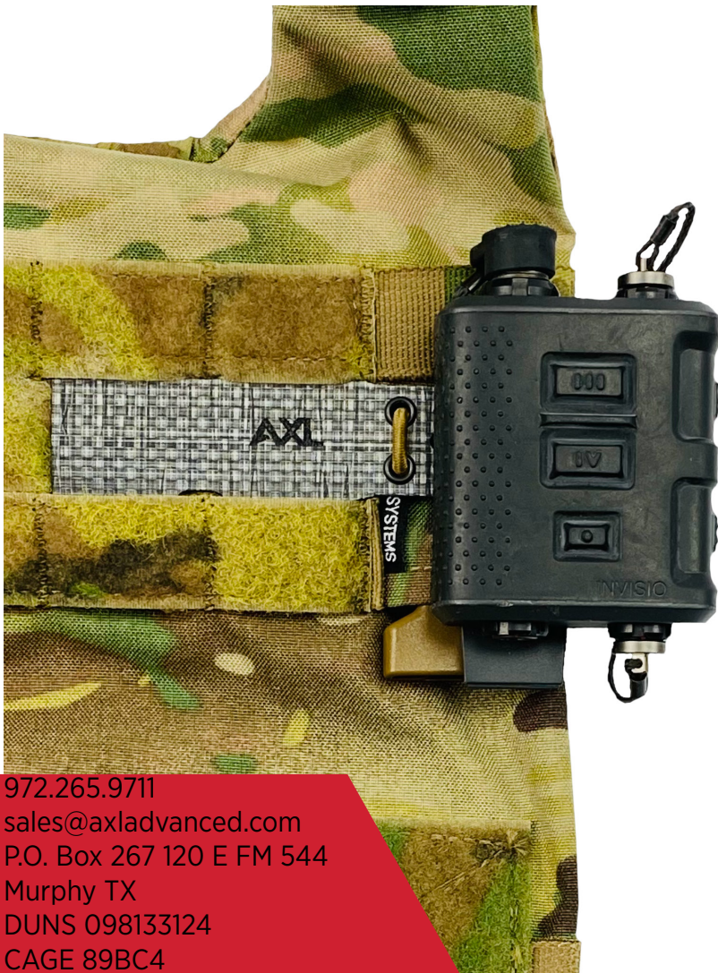
Correctly mounted Commsled with Invisio® V60 shown on a Spiritus Systems® LV119 Overt

972.265.9711 sales@axladvanced.com P.O. Box 267 120 E FM 544 Murphy TX DUNS 098133124 CAGE 89BC4