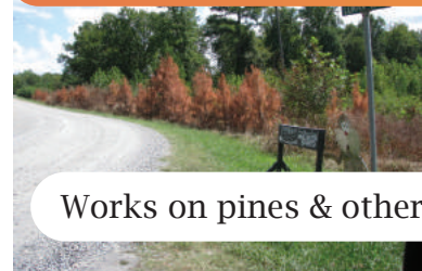
Works on pines & other woody stems

Works on everything from grasses, to broadleaf weeds to woody stems, controlling just branches or entire trees.