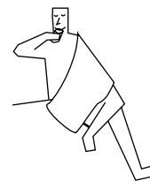
Relax with juice or water

You liked it? Do it once again and you will feel great.