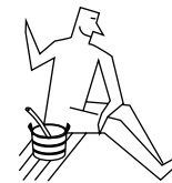
Sauna (10 - 15 min.)