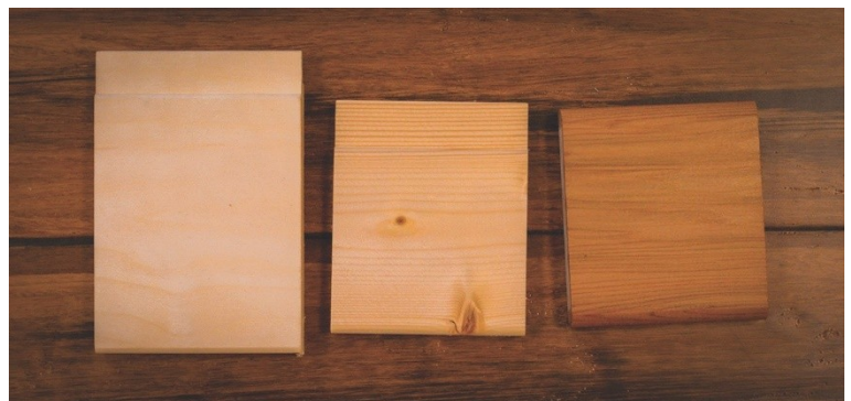
Aspen, Spruce, and Cedar treated with paraffin oil

The wood used for sauna rooms vary widely, usually depending on what types of woods are available locally. Sauna woods for walls and ceiling are milled with tongues & grooves (T&G) that interlock tightly and make installation easy. Superior Sauna uses Aspen, Spruce, and Cedar for our saunas.