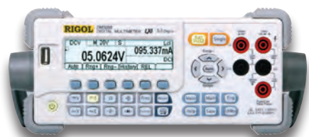
DM3000 Series Digital Multimeter

Models starting at just $450 Compare vs Agilent E3633A