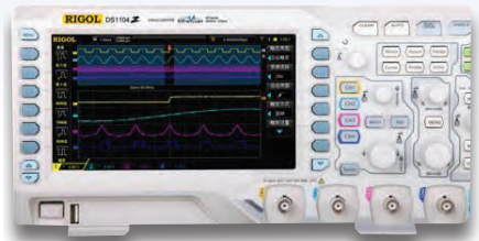
DS1000Z Series Digital Oscilloscopes

Models are available at 50MHz through 100MHz, with 1GS/Sec Sampling, up to 24MPts of memory and a Multi-Level Intensity Graded, 7" WVGA display. The DS1000Z Series of Digital Oscilloscopes is the perfect choice for educators needing an advanced analysis oscilloscope. Available options like 16 channel logic analysis, serial decode and an integrated 2 channel source make this a powerful analysis tool.