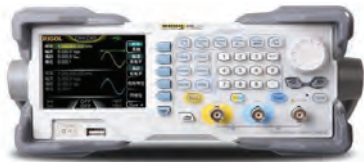
DG1000Z Series Arbitrary Waveform Generator

Models starting at just $399 Compare vs Tek DS02000 and Agilent DSOX2000A