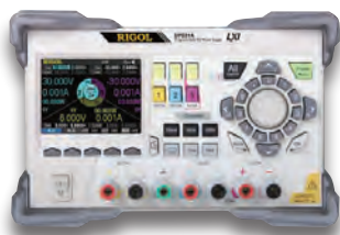
DP800 Series Programmable Power Supplies

Models starting at just $680 Compare vs Tek AFG3000 and Agilent 33500B