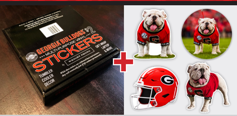
SUPER SELLER 100 STICKER PACKAGE (STKSUP-SD100): 75.00