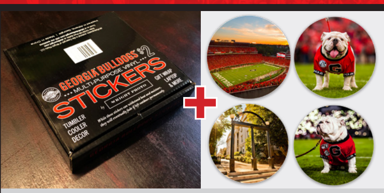
CAMPUS 100 STICKER PACKAGE (STKCAM-SD100): 75.00