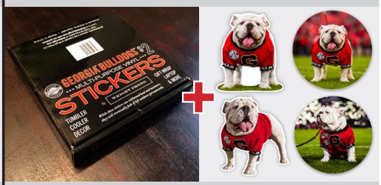
UGA X MASCOT 100 STICKER PACKAGE (STKMAS-SD100): 75.00