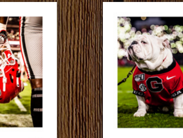
Light up Uga - POS033