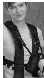
H717 + H435

H431, H432, H433, H436, H437, H439, H441 See above harness link for details on these various adapters.