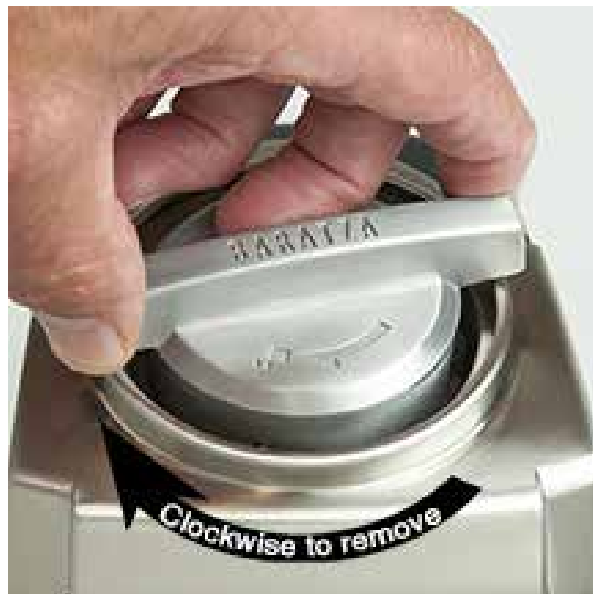
Turn burr clockwise to remove

Wash the grounds bin, hopper, and the hopper lid in warm soapy water, then rinse and dry.