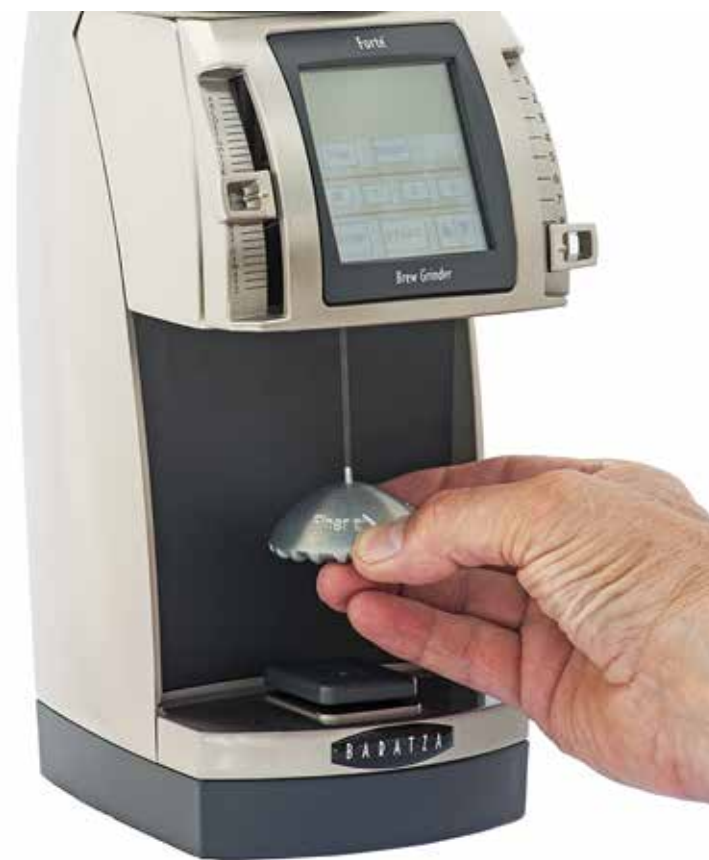
Use the burr calibration tool while the grinder is running.

Turn the grinder on and lower the Macro and Micro levers, all the way to the bottom. Let the grinder run long enough to expel any remaining ground coffee. Remove the grounds bin (For Vario-W and Forte , TARE the grinder). Now press any one of the preset buttons, then press START and insert the Calibration tool into the 2mm Allen head screw (The grinder will run until you press the STOP button). With the motor running, move the Macro arm up to the top (setting 1). You should not hear any change in motor speed. Now, slowly move the Micro arm up to the midpoint(setting M). If the motor hasn't started to slow, use the calibration tool to turn the calibration screw toward the finer direction (as indicated on tool) until you hear the motor start to slow. This setting will allow for a full range of grind. If you want a coarser grind, insert the tool and turn the opposite direction of the arrow on the tool.