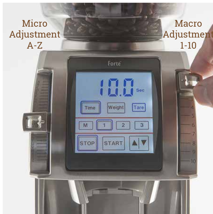
The Forté™ must be running when grind adjustment are made.

The full range on the Micro scale is equal to one “click” or position change on the Macro scale. Adjusting levers UP produces a smaller particle size, adjusting levers DOWN produces a larger particle size.