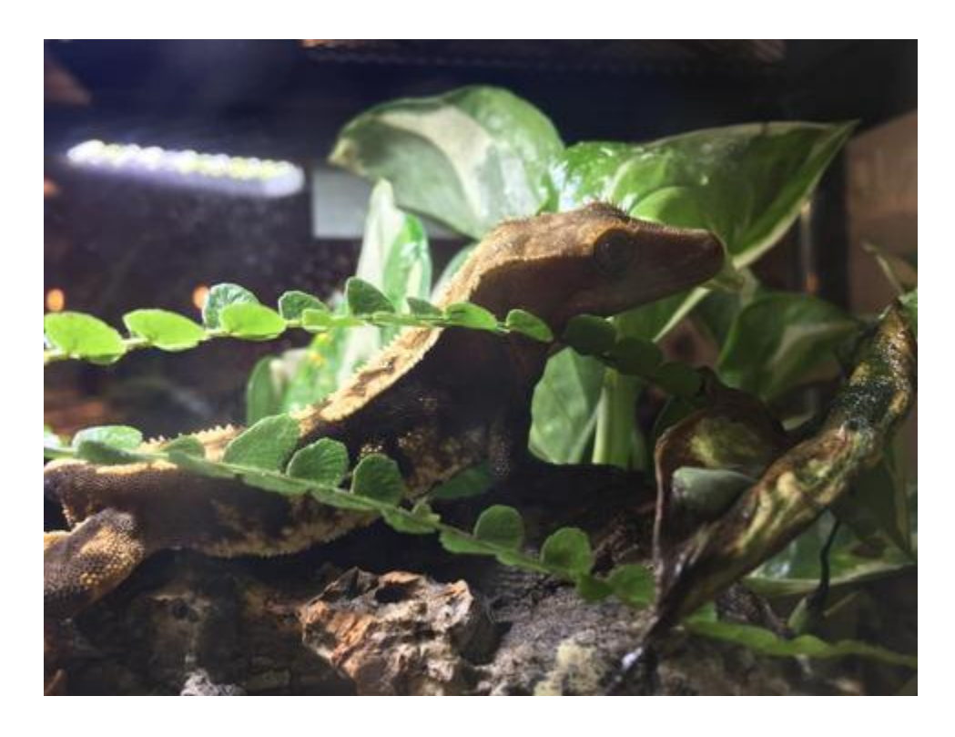
The Dude Abides