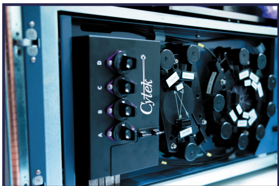
Cytek 4-PMT box mounted on Aria door