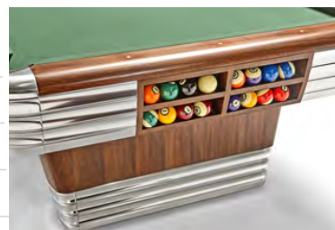
above shown with ball storage box